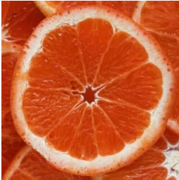
Image 1. Grapefruit